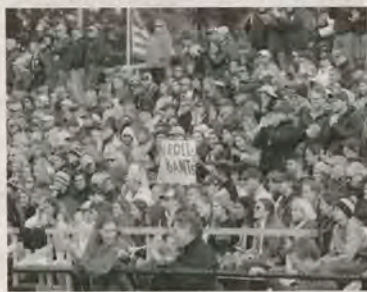
TRINITY COLLEGE: Trinity Community Cheering on the Bants

Also this weekend will be sporting events for everyone to watch and show Trinity spirit. Our field hockey team and men's and