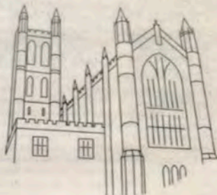
TRINITY COLLEGE STUDENT GOVERNMENT ASSOCIATION