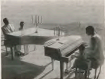
"Man or Muppet" Scene in The Muppets

While this scene is emotionally riveting, Walter does not get enough credit for his role in it. Gary is originally presented with the question, but his argument with Mary about whether he is a man or a Muppet is simply due to his recent commitment to Walter and the Muppets' fundraiser. In contrast, Walter has reached this point after decades of not fitting in and never understanding why. Walter's position here is infinitely more vulnerable, yet the