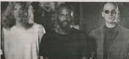
vtropes.org: the Band Death Grips

Of course, others remain skeptical. The date could simply indicate some sort of announcement as opposed to a full-on re-