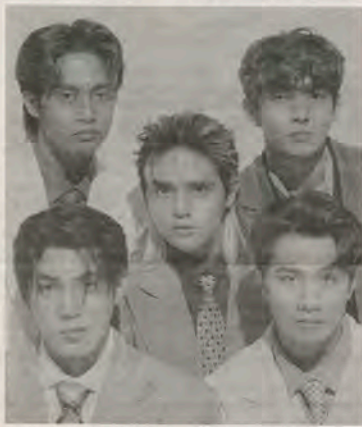
Spotify: Filipino Boy Group SB19 Members

SB19 heralds a new era for themselves and the Philippines. They should not just be compared to K-pop artists but be regarded as equals in this competitive industry. They will hopefully support the development of P-pop as more Filipino artists/groups make headway, such as boy group BGYO and girl group BINI. SB19 can maintain their bright future by not only reaching global fame but, most importantly, representing the ambitious and humble values of Filipinos everywhere in the world.