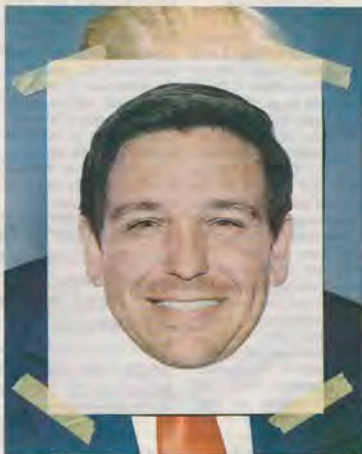
The New York Times' Ron DeSantis' Face on Trump's Body

"DeSantis has effectively captured the moment, asserting himself as a major opponent to Biden and a standard-bearer of the right—a station that he could perhaps turn into a presidential bid."