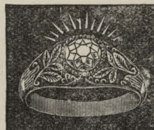
No. 96, $8.75 1/4 Ct. Size Stone, Fine Solid Gold, Hand Engraved Rose Finish, Gypsy Mounting.

socially, in college life, in business, in every human relation —yet so few can afford to wear stones of the character, size and quality they desire. Even those who can afford the costlier gems, often prefer the Baroda Diamond, for safety, as well as for the immense saving.