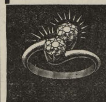
No. 119, $8.45 Baroda Diamond Set Ring, Each Stone 3-4 Ct. Size in Fine Solid Gold, Elegant Hand Made Two Stone.