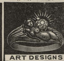
No. 131, $10.60 1/4 Ct. Size Stone, Beau- tiful Hand Carved, Fine Solid Gold Mounting.

BARODA CO., Dept. 215 1458 Leland Ave. Chicago, Ill. (Illustrations Catalogue Upon Request—Baroda Diamond, Pearl, Ruby, Sapphire Rings; La Valliere, Emblems, etc.)