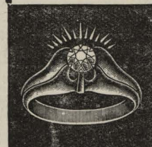
No. 98, $7.30 1/4 Ct. Size Stone, Fine Solid Gold, Tooth Mounting.