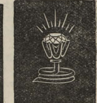
No. 126, $5.10 Baroda Diamond Set Stud, 1 Ct. Size Stone, in Fine Solid Gold Stud Mounting.