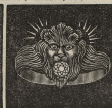
No. 130, $9.19 Baroda Diamond Set Ring, 1-4 Ct. Size, Beautiful Hand Carved, Solid Gold Mounting.