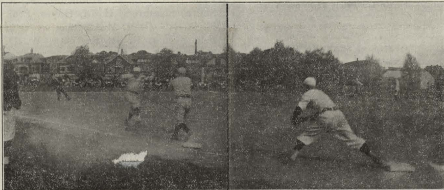
SHELLEY RACING FOR FIRST.