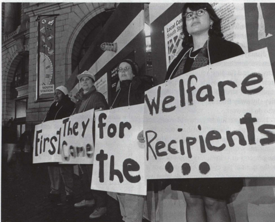
"First they came for the Welfare recipients," warn women gathered at a rally in Massachusetts.

But in our anti-capitalist hearts, we know this economy can't provide jobs at livable wages for all. As feminists we know that the work of care within families is profoundly competitive with the hours needed for breadwinners' wages. And the long lasting wounds from failed and battering relationships can leave women and their children unable to handle more than the tough job of holding body and soul together. We know too much not to see welfare reform as a deeply felt impulse to put bad women back in their place. Flawed and racist as welfare practice has been, as anti-racists we know that welfare is still an essential protection against an acutely racially strati-