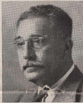
Judge Harold R. Medina