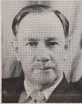
Sir Percy Spender