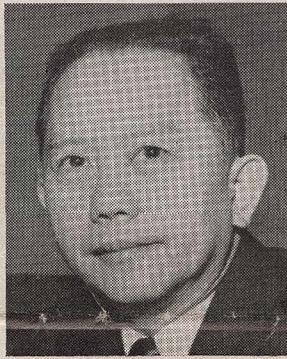
Gen. Carlos P. Romulo