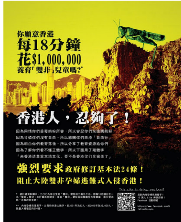
Figure 3 Hong Kong’s locust poster

Mainland women in Hong Kong. The “patient-zero” of this war of ad campaigns depicted a large locust sitting atop of Hong Kong’s iconic Lion Rock with the Victoria Harbor in the background, and in bold words it says: “Are you willing for Hong Kong to spend $1,000,000 per 18 minutes to accommodate foreign born children? The Hong Kong people have had enough!” Furthermore, the ad requests