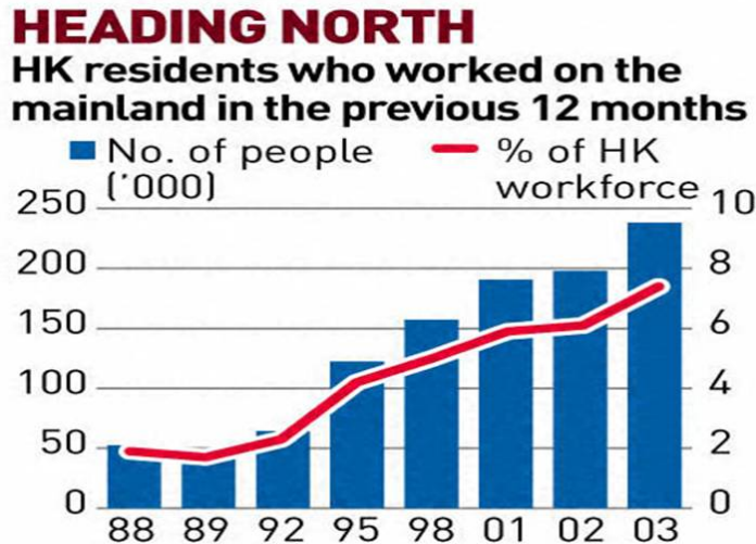
Figure 1 Hong Kong's Labor migration

China's economy has made many drastic changes since the Maoist years of the Chinese Communist Party and it is important to understand the country's historical economic development in order to better comprehend its modern day economic status. In 1949, after Mao had just risen to power after defeating Chiang Kaishek and the Kuomintang in the Chinese Civil War, Mao implemented China's first Five Year Plan in 1953, which was adopted from the Soviet economic model of centralized planning and state owned sectors (Horlemann). The purpose of this first Five Year Plan was to stimulate economic growth with a strong emphasis on heavy industrials, such as iron and steel production. That first year of the Five Year Plan resulted in real GDP growth of 15.6%, which was partially due to the land reforms