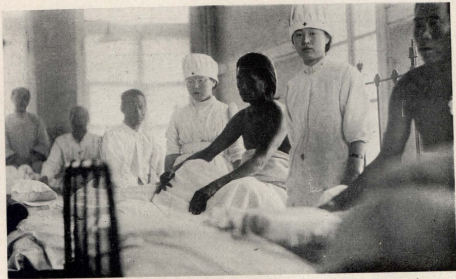
Almost at the first shot fired, Chinese physicians fled deserting their patients in hospital. These civilian patients were removed to the Japan Red Cross Hospital at the first opportunity.