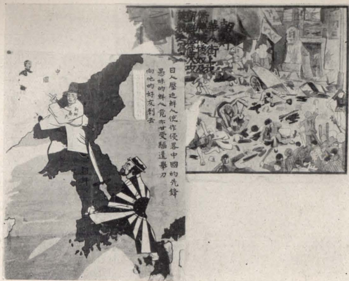
A pair of inflammatory posters put up on the street. The picture on the left side shows a Korean entering Chinese territory at the point of the Japanese bayonett. The drawing on the right shows the massacre of Chinese people by both Japanese and Koreans.