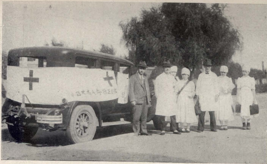
Col. Doihara, who was for a time in charge of civil administration in Mukden, organized a medical clinic to administer help to the native civilians abandoned in their sick-beds.