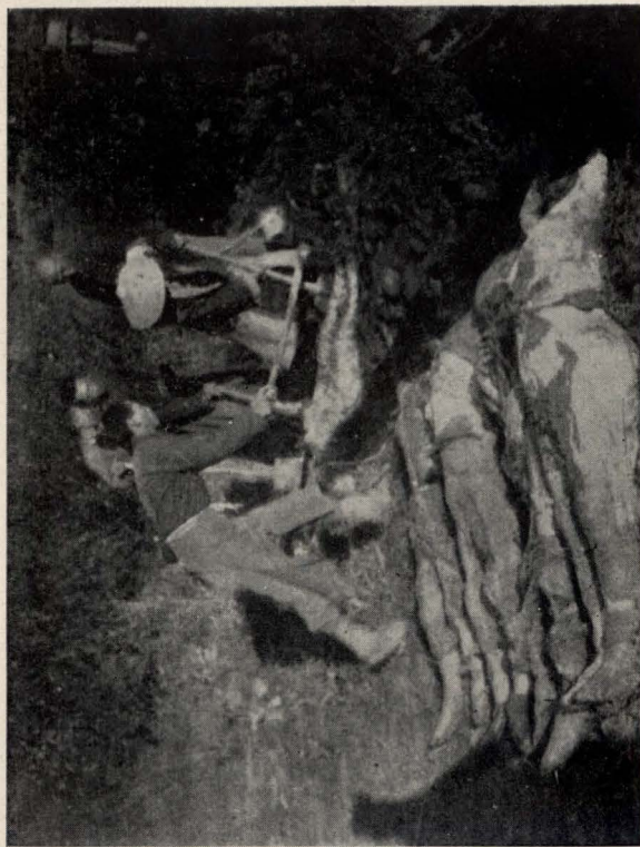
Digging for mutilated remains of Koreans at Kuchiatze, Manchuria.