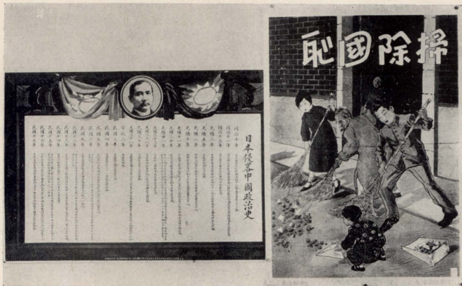
Some of the anti-Japanese posters put on the streets. The left cut gives a chronological record of "Chinese Political History of Japanese Invasion." The picture on the right hand side shows Chinese "sweeping national humiliations" out of their house.