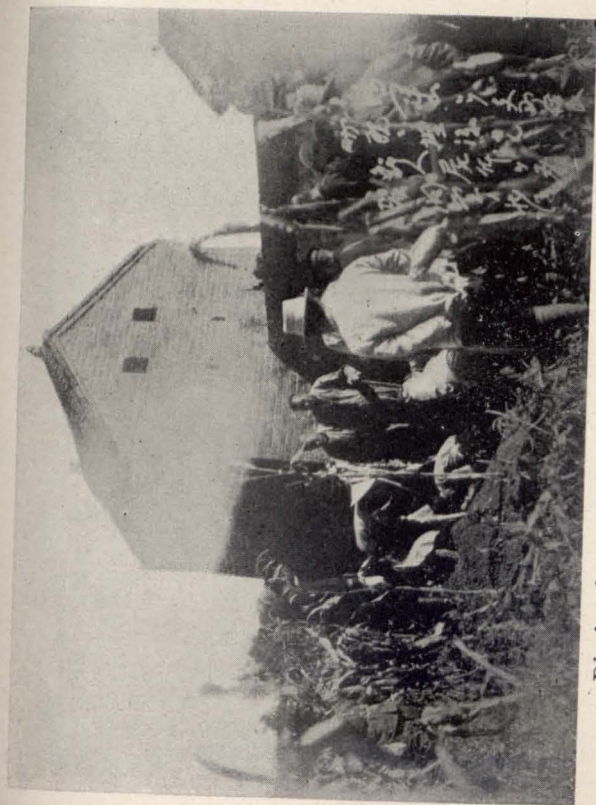
Digging for mutilated remains of Korean farmers.