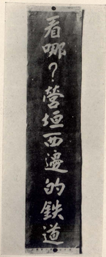
One of the inspired posters plastered on a wall in the military barracks at Peitaiying, near Mukden. It reads: "Keep a watch at the railway to the west of our barracks."