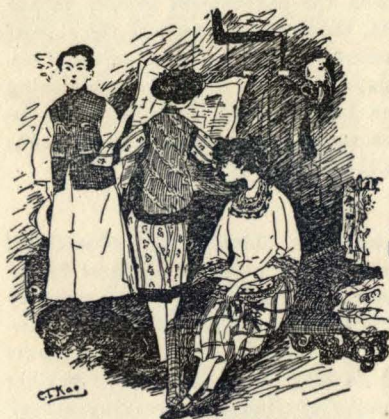
Chinese Costumes Modern Style: 1875—1921

the school attendance compulsory to all the children of school ages in the country until the end of the eighth grade.