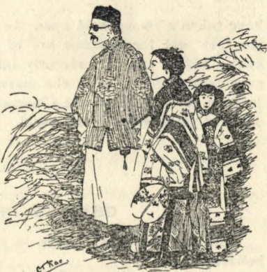
Chinese Costumes "Medieval" Style: 1644—1875

(2) The law of compulsory education. It provides an eight year program which, when put into effective operation, will make