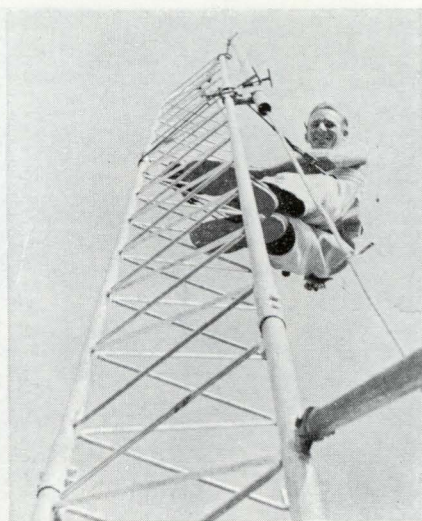
The 30-foot antenna located atop the Chemistry building boosts power of WRTC-FM so it can now be heard as far away as Springfield and New Haven.