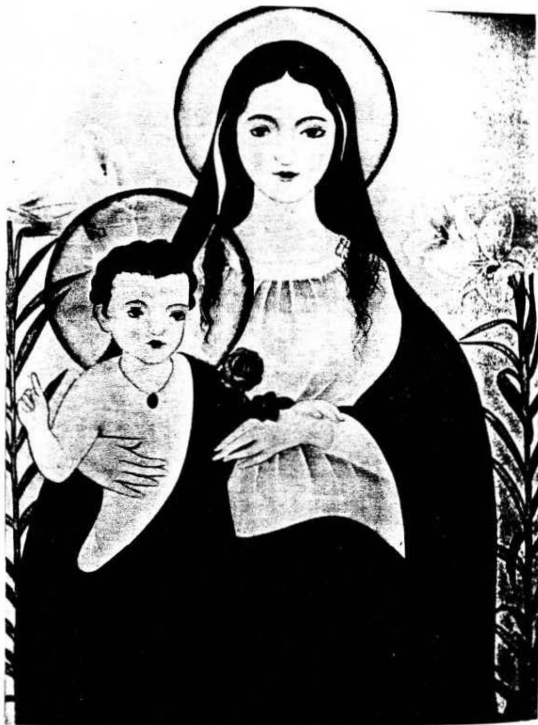
THE MADONNA OF THE ROSE—OKAYAMA