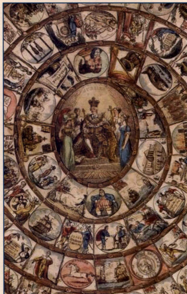
A board game depicts snippets of British history.

The exhibition, which runs through June 12th, features works ranging in date from 1575 to 1899, and includes the following: a two-volume history of Ireland (1795) that so interested George Washington that he bought 50 copies; a jigsaw puzzle board game (1810) played by the youth of the British Empire; a large copper plate engraved with the image of a raven, used to print a famous British ornithological work (ca. 1840); two volumes of Japanese art (1899, Ukiyo-e school) containing color prints of birds and flowers; and a series of "reciters"--a long-running popular culture genre which anthologized stories, skits, jokes and poems designed for oral presentation during family hours or in public (school, civic events, lodge functions, etc.). Please stop in and see these items and more, all of which have been acquired since August.