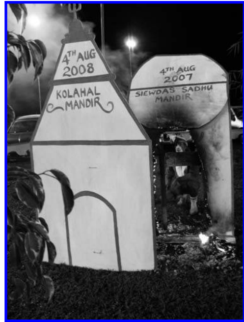
Figure 19. The burning of a small ashram replica during Ramleela commemorates the vandalism of Trinidad’s Siewdass Sadhu and Kolahal mandirs on 4 August 2007 and 4 August 2008. Baal Ramdilla, October 2008.

Another way to say it: I am a Trinity—a Trinidadian, a Hindu, and an Indian. If you take one away from these three, you leave nothing. I have to be me by being the three at the same time. A lot of these things are discovered in the search. Not in the general Hindu