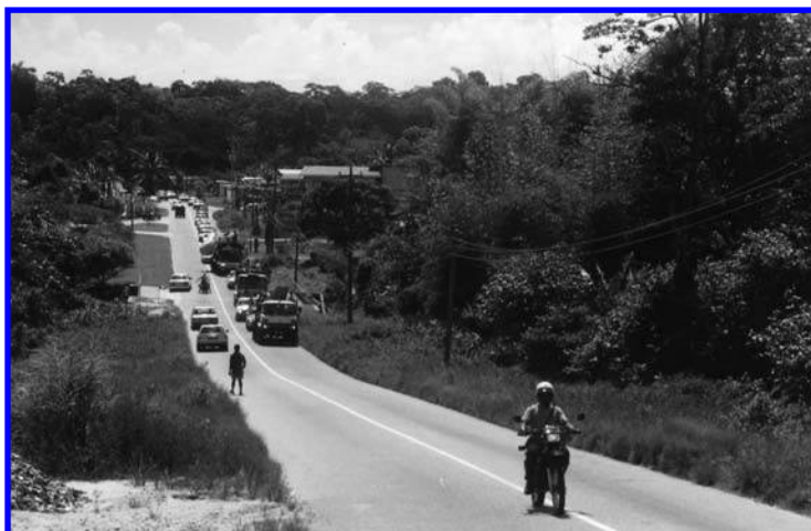
Figure 14. Procession to bring Ravan effigy from Sangre Chiquita to Sangre Grande, complete with police escort, mic car, and a procession of vehicles. This several-mile procession is unique in Trinidad. Day 10 of performance, 1999.

The second procession, on the eleventh night, begins at the mandir in Sangre Grande and ends at the grong on the Hindu school grounds, symbolizing the way that Sangre Grande, like the Maha Sabha itself, consistently links education to religion. This night signifies the “triumph