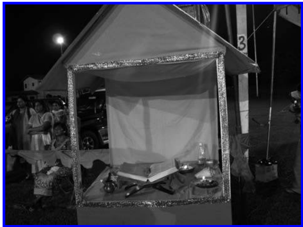
Figure 5. The Manas established in the Baal Ramdilla venue, appropriately in the East. Enterprise, Trinidad, October 2007.

Trinidad is the gateway to Tulsidas, the way into the Ramleela, in this venue and across this country. The Palmiste Trinidad portal is, thus, an emblem of the multilayered process through which the Manas has been actualized in Trinidad. The grong itself encapsulates the epic geography of India, from Ayodhya in the North to Lanka in the South, performatively both expanding and condensing the space. The grong expands to embrace the history and mythos of Ram’s India, translocated to the local ground; at the same time, it condenses the geography so that both India and Trinidad coexist in the space. Indeed, though it is customary to talk about