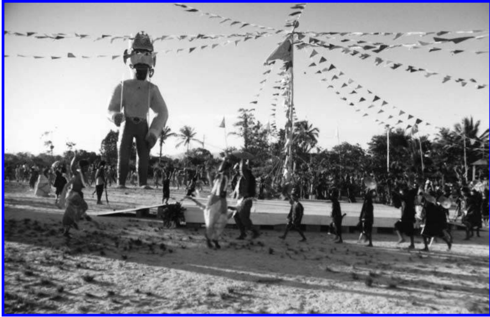
Figure 13. The approximately 60-foot effigy of Ravan towers over the grong. The raised platform in the center is identical to the platform in the Harlem Village Ramleela, which was mentored by the Sangre Grande Ramleela Committee. Sangre Grande, 2006.

If the family relationships in Dow Village and Felicity are extended throughout the community, the essential Ramleela unit in Sangre Grande is that of teacher with students, who together with the committee and the adult actors form an extended Ramleela family. 45