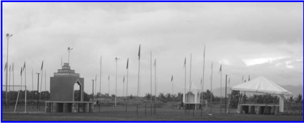
Figure 4. The Baal Ramdilla grong (playing ground). The Ayodhya loka (white) is in the North; Lanka (blue) in the South. Baal Ramdilla, Enterprise, Trinidad, October 2007.

impact on the culture of the island is profound, though often contested, sometimes seemingly invisible, and partially isolated, as the Indian people—pejoratively called “coolies” throughout much of their history on the island—have often felt themselves to be since their first arrival as indentured laborers in 1845 (see Clarke 1993:121; Khan 2004:61–63). Widespread throughout the island and yet relatively unknown even to many Trinidadians, the annual reenactment of Ramleela encapsulates much Indo-Trinidadian history.