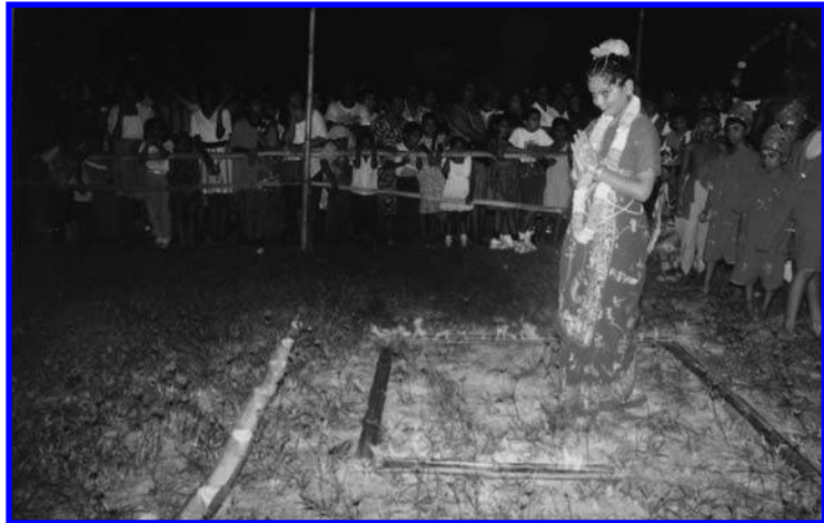
Figure 15. The true Sita emerges from the fire test, replacing the false Sita before the final return to Ayodhya. Sangre Grande, Trinidad, 2003.

(the traditional guru/pundit student relationship in Hinduism). This sense of community is enhanced by the fact that some performers live at the site for the duration of the performance. Theoretically, as was true years ago in Dow Village and other venues, this is a privilege accorded only to swaroopas. However, since the major roles are often taken by children or young teenagers, this option has been extended in Sangre Grande to the entire cast so that