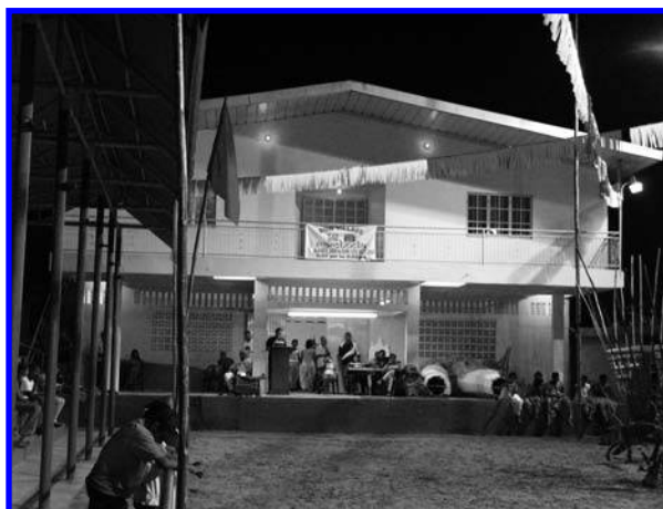
Figure 8. Dow Village permanent building at the south end of grong, view from the north, with porch and door of storage area visible. October 2008.

(Bhagaloo 1992), and which now houses the boat and other Ramleela props throughout the year (fig. 8). The command stand for the vyasa and musical accompaniment for the Ramleela are on the porch of this building, rather than in the East, the natural logistics of the setting determining and slightly skewing the epic orientation. 37 Because of the proximity and the relatively stationary nature of the seated audience, the players and the viewers seem to integrate interactively with each other. Indeed, when I first visited on 12 October 2007, children thronged the bamboo fence that separated the darshakas from the performers.