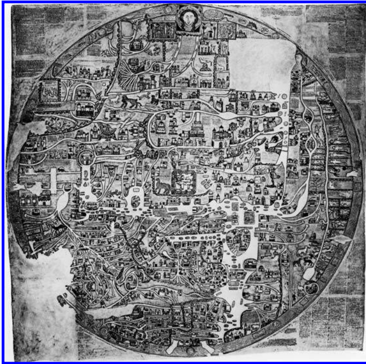
Figure 2. Ebstorf mappa mundi . Note the head of God at the top, designated as East, with the feet and hands embracing the world at the other three poles. This map was destroyed by allied bombing in 1943 and is reproduced from facsimile copies. (from Gervase of Tilbury, ca. 1234)

describing the arc of Ram’s bow, all within a five mile radius of the Gulf of Paria” (Hindu Prachar Kendra 2007). Also in 2006, Carifesta, the pan-Caribbean presentation of festivals that takes place every few years, moving from one island to another, was held in Trinidad and Tobago. For the first time, Ramleela— identified as one of UNESCO’s “43 new [i.e., newly listed] masterpieces of the Oral and Intangible Heritages”—was registered as a Carifesta activity, with nine of the venues agreeing to be listed as “official” Carifesta sites, and two groups presenting episodes from the longer play for Carifesta in Port of Spain (Hindu Prachar Kendra 2007). 5