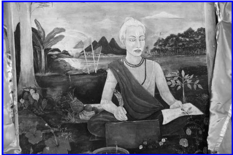
Figure 17. Caribbean Tulsidas (1997), conceptualized and designed by Raviji (painted by Rachna Treau), commemorates the 500th anniversary of Tulsidas’s birth. Tulsidas sits among Caribbean emblems, such as the Trinidad mountains and tropical trees.

Such episodes recur throughout the Baal Ramdilla, but the one that was most powerful in 2007 and 2008 resonated tragically rather than comically. Trinidad has a mandir popularly called the Temple in the Sea in Waterloo on the west coast of the island, a replica of a small mandir built by a Hindu laborer, Sewdass Sadhu, over several decades, beginning in the 1940s. His first mandir, which was built on sugar company waste lands, was broken down by the authorities;