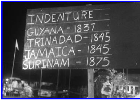
Figure 18. Amarnath Ranjitsingh, dressed in a turbaned costume bearing the colors of the Trinidad flag, carries a poster with dates from the history of indentureship, continuing the educational function of Ramleela. Baal Ramdilla, Enterprise, Trinidad, October 2007.

was vandalized; this too was commemorated in the 2008 Ramdilla. The gathered audience was reminded of the sanctity of the temples and of their desecration, as this mytho-historical episode in the sacred drama cathartically touched their lives (fig. 19).