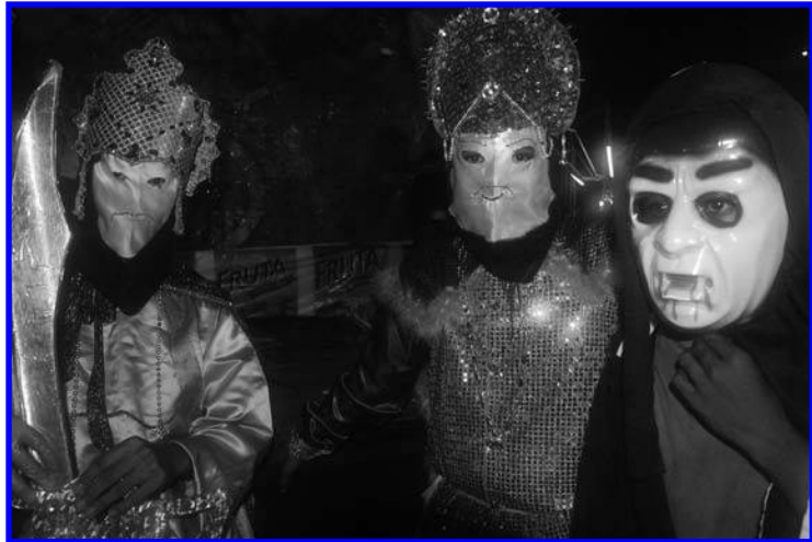
Figure 12. In Felicity , demons are masked, as here, where there is a combination of built and purchased masks. Felicity , Trinidad, October 2007.

second visit three nights later), attempted to lure the royal brothers with the gyrating energies of the local pelvic twisting dance known as wining, identified with Carnival, a festival associated by many Hindus with darker and more profane sources of energy than those of Ramleela. Part of the strategy of engaging the audience comically also included a raggedly clad, ambiguously gendered village jester who circumambulated the fence with a live puppy. Even when the crowd thinned during the heavy rainfall, the jester kept to his/her performance, teasing invisible audience members with the same energy s/he had given to the crowd earlier in the evening.