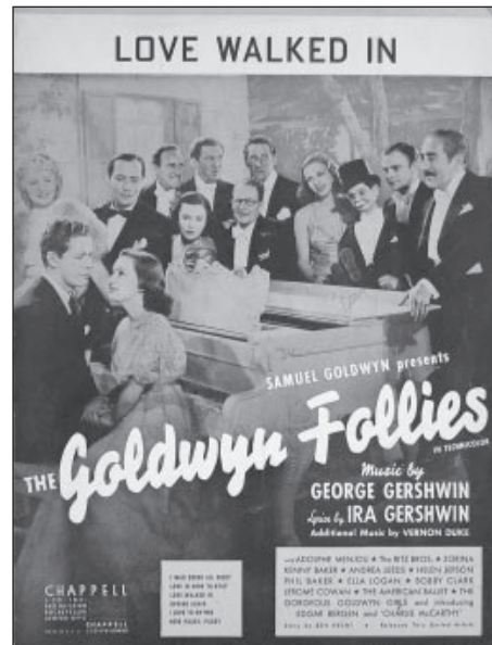
Love Walked in (1938)

Additional songs by Gershwin include: the feature song, Embraceable You (1930); Boy What Love Has Done for Me (1930); Summertime (1935) from Porgy and Bess ; They Can't Take That Away From Me (1937); and Love Walked In (1938). The recording of Embraceable You was made by Nat King Cole in Los Angeles, circa 1944, for Capitol Records (Gunshanan Collection).