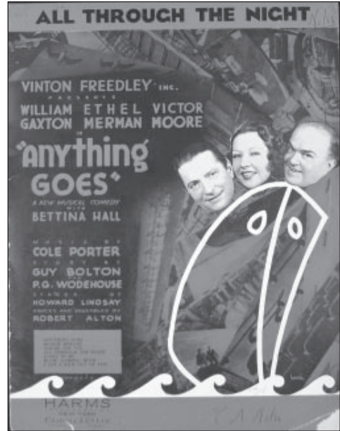
All Through the Night (1934)

Another cover displayed is for All Through the Night (1934), also from Anything Goes . The cover depicts Ethel Merman in company with her co-stars William Gaxton and Victor Moore (Niles Collection). Other covers are for Miss Otis Regrets She's Unable to Lunch Today (1934), Ev'rything I Love (1941), and Don't Fence Me In (1941), the latter as included in the Warner Brothers film Hollywood Canteen (1944). The song was popularized on the screen and in recordings by Roy Rogers, Kate Smith, and Bing Crosby